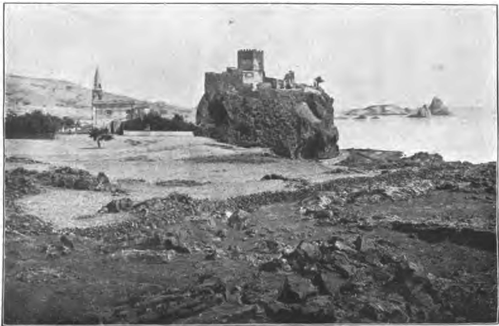
BAY OF TREZZA—THE CYCLOPEAN ROCKS—ACÌ CASTELLO.