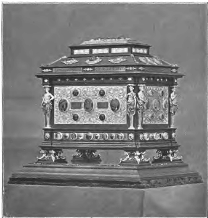
AMBER JEWEL CASKET