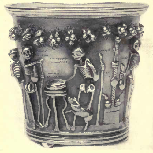
Fig. 1.—Silver cup forming part of the so-called Boscoreale treasure in the Louvre Museum at Paris, supposed to date from the first century of the Christian era. Photograph from the facsimile in the Victoria and Albert Museum, showing the skeletons, or "shades," of the philosophers Epicurus and Zeno.

They are adorned with figures of skeletons ("shades"<sup>17</sup>) and garlands of roses, and bear various inscriptions, some of which urge the enjoyment of pleasure whilst yet life lasts, and whilst enjoyment of anything is possible: Eat,