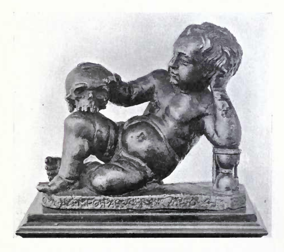
Fig. 57.—Italian bronze statuette (fifteenth century?), representing an allegory of life.