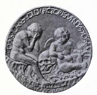
Fig. 13 (reduced).

(I. and XVII.) Memento mori medals by Giovanni Boldu, of Venice, 1458-1466.