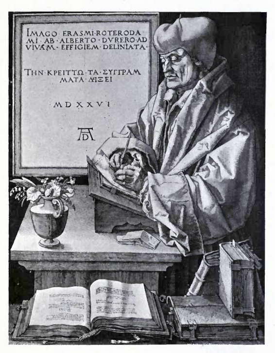
Fig. 16.—Engraving of Erasmus by Dürer. Reduced from an example in the British Museum.

writings of Erasmus, as some have supposed, but to death, the common goal of all, i.e., as the medal itself