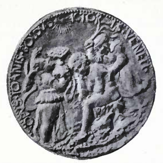
Fig. 56.—Reverse (reduced) of a medal by Giovanni Boldu of Venice. (After Heiss.)