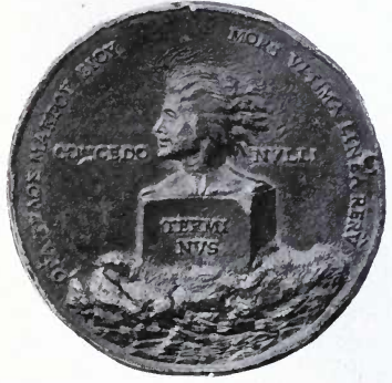
Fig. 15 (reduced).—From a specimen formerly in the author's collection.

Croesus, King of Lydia, as the latter afterwards, when defeated and a prisoner, explained to his conqueror, Cyrus. "Opa \tau \acute{e} \lambda \sigma_0 is the ordinary Greek equivalent of the Latin "Respice finem;" and like \Gamma \nu \acute{a}\theta_1 \sigma \epsilon \omega \nu \acute{e} \nu \acute{e} , it is included amongst the wise sayings of the seven wise men of Greece.