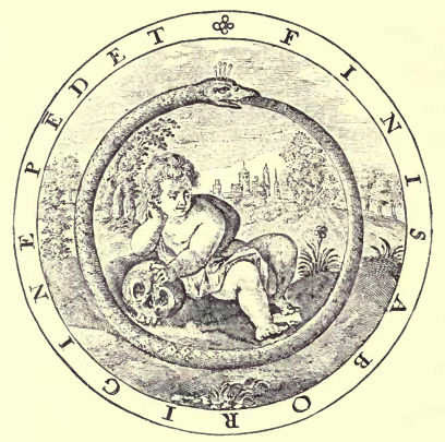
Fig. 32.—Design from Wither's Emblems, 1635.

I think these pieces may have been produced to be