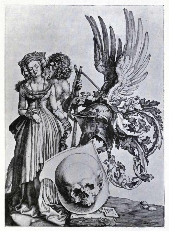
Fig. 2.—Dürer's so-called "Wappen des Todes" (engraving in the British Museum).

"Wappen des Todes" (Fig. 2), it seems to me that the engraving in question (1503) has a different meaning 24