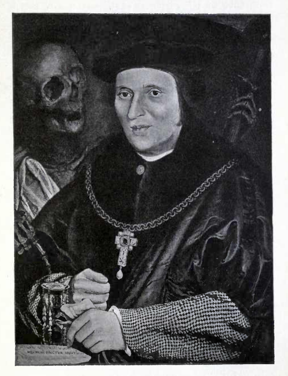
Fig. 5.—Holbein's painting of Sir Brian Tuke, in the Munich Pinakothek.

A similar train of thought is suggested by Holbein's portrait (in the Munich Pinakothek) of Sir Brian Tuke,