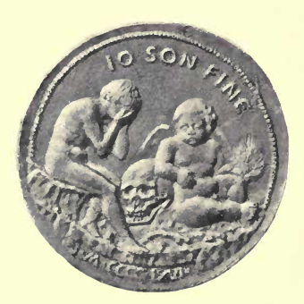
Fig. 14 (reduced).

A third medal, made by Boldu in 1446, represents the bust of the Roman Emperor Caracalla on the obverse,