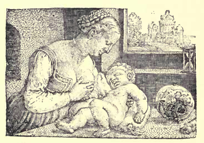
Fig. 4.—Mother and child, with skull and hour-glass. Engraving by Barthel Beham, in the British Museum.

from which the hand of a skeleton holds out a winged hour-glass.<sup>31</sup> In an anonymous Dutch engraving of the