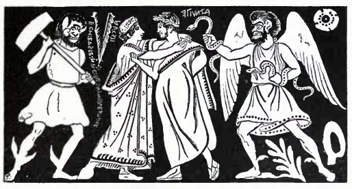
Fig. 45.—An Etruscan "parting scene," with the Etruscan "Charun" holding hammer and a winged demon holding snakes. From a painted vase (after Dennis).

In Etruscan death-scenes the Etruscan Charun is occasionally represented (see Fig. 45) accompanied by various Gorgon-like or Fury-like demons, sometimes holding snakes in their hands, including "Vanth," probably the Greek Thanatos (\Theta \acute{a} \nu a \tau o \varsigma) . A somewhat