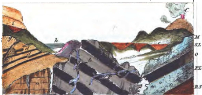
Stratified Rocks Holz Formations and alluvial deposit.