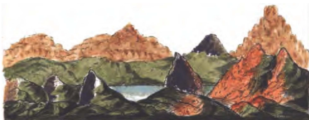
Primitive Rocks & Secondary.