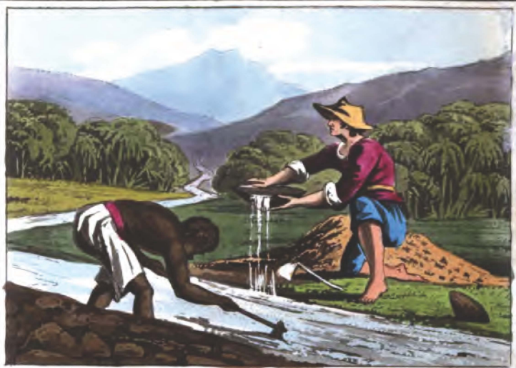
A BRAZILIAN MINER WASHING THE ALLUVIAL SOIL (RAKED FROM THE RIVULET) FOR GOLD & DIAMONDS.