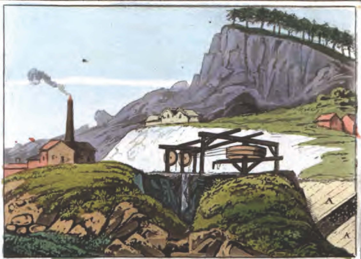
VIEW NEAR MATLOCK, DERBYSHIRE.